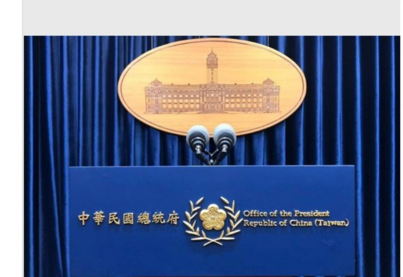
2023/12/17 Presidential Office thanks Biden administration for announcing its 12th military sale to Taiwan