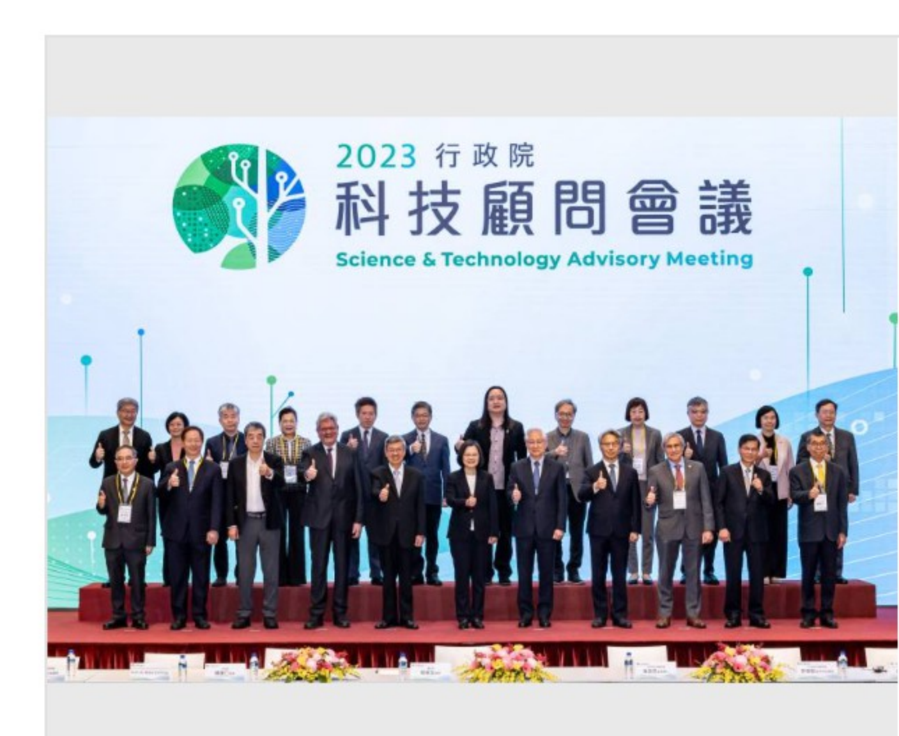
2023/12/18 Launching Science and Technology Advisory Board Meeting Depicting Taiwan's New Science and Technology Power