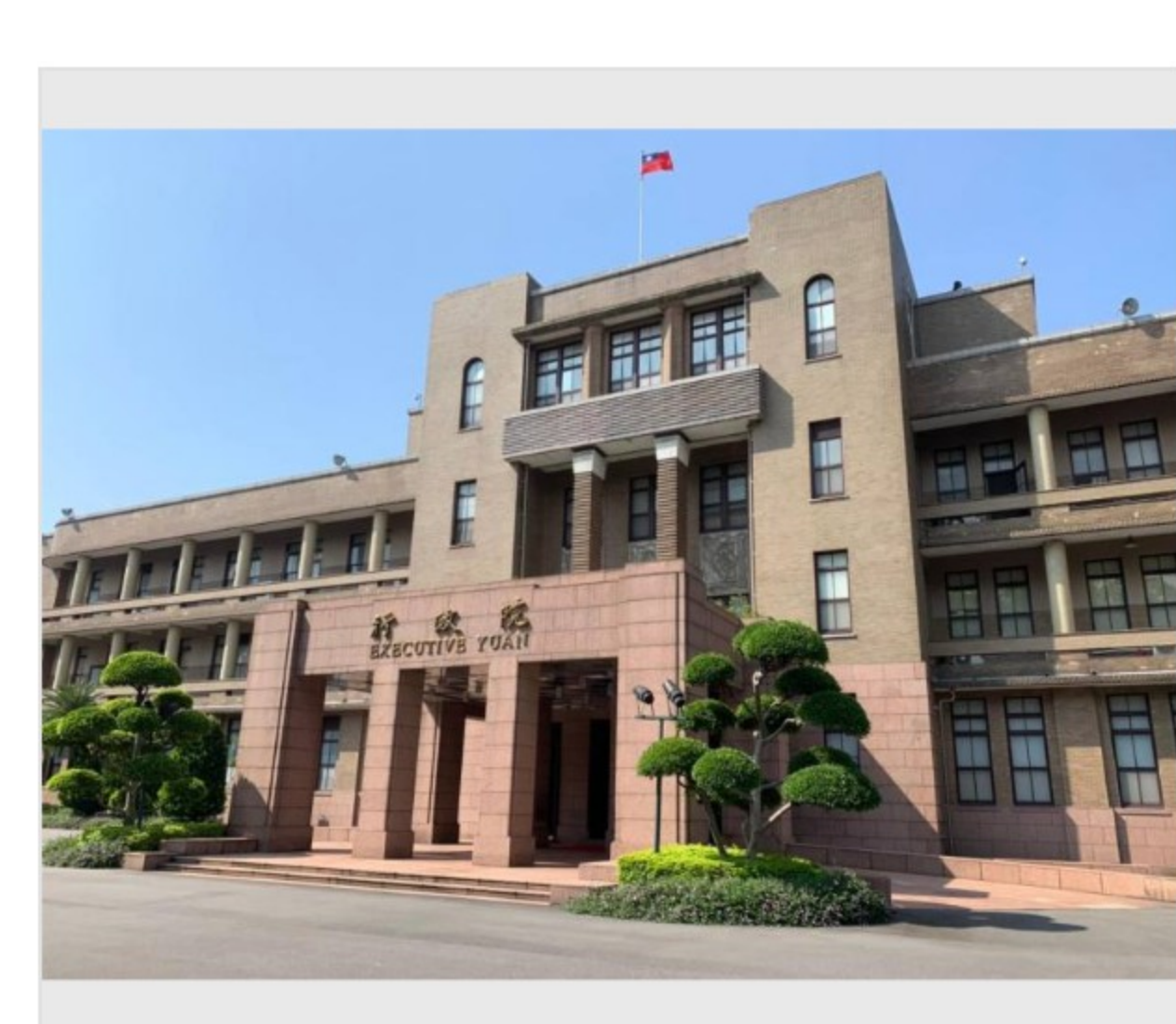
2023/12/18 Premier lauds achievements on social housing, targets 1 million