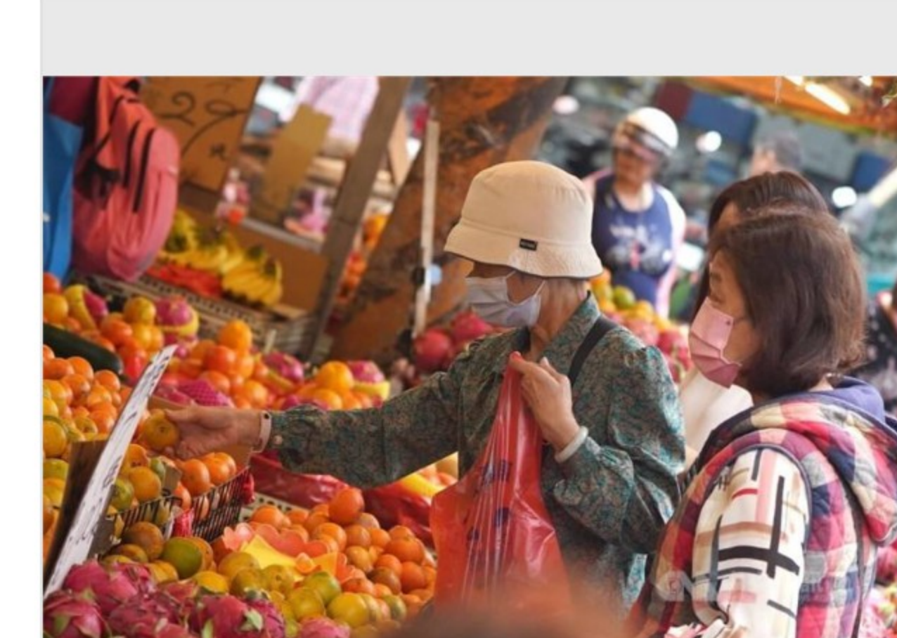
2023/12/17 Taiwan's GDP growth to hit 3% in