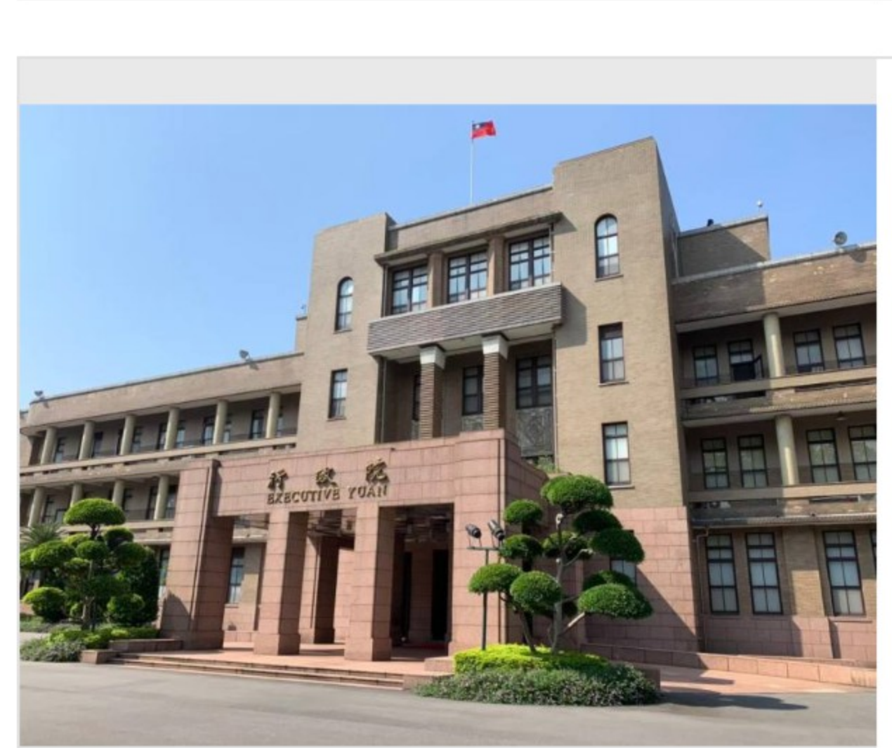
2023/12/17 Premier instructs agencies to ensure just, fair and open elections